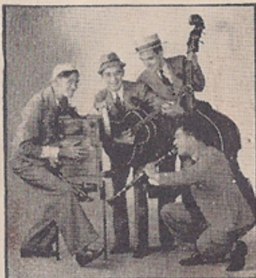
HOOSIER HOT SHOTS